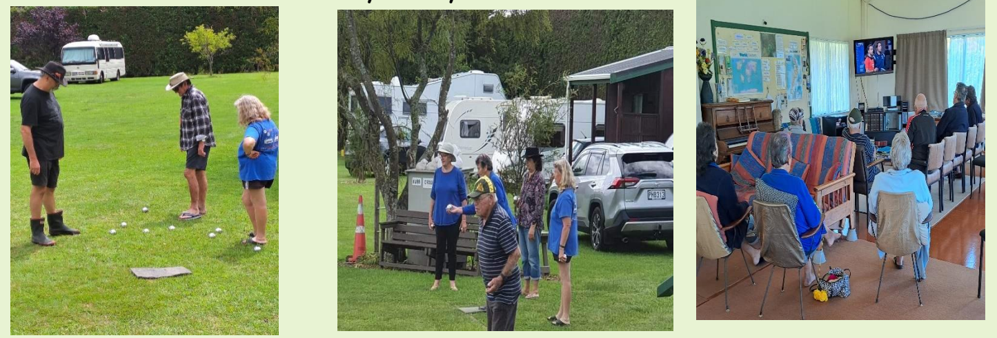
A tense moment

weekend. The weekend of 18/19 November saw a group of hardy WOS members brave the elements to enjoy some games of petanque and kubb between showers. Participants managed some very tense games with eventual winners and losers disclosed during happy hour. A delicious "pea, pie and pud" meal was served up and the evening concluded with several games of 5 crowns. Sunday morning saw some members even decid to forgo their sleep in order to watch another game of rugby, with mixed reaction to the result - Oh well there is always next year!